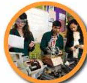
Manufacturing, Engineering and Technology