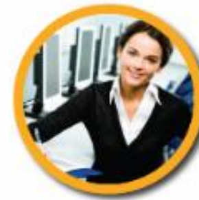
Business Management and Finance