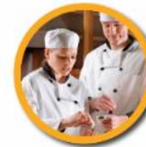
Consumer Services, Hospitality and Tourism