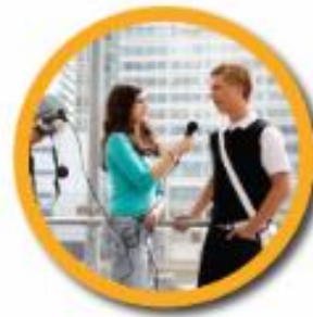
Arts, Media, and Communications