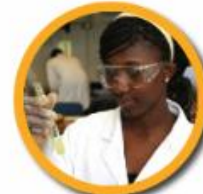
Health and Biosciences