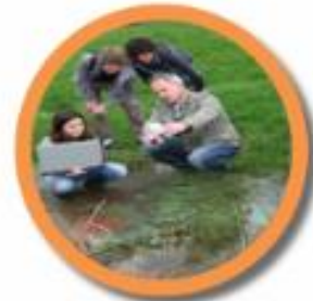
Environmental, Agriculture and Natural Resources