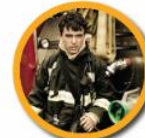
Human Resource Services