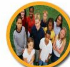
Career Research and Development