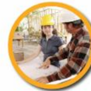
Construction and Development